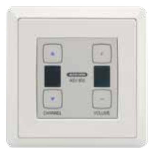
Input and control