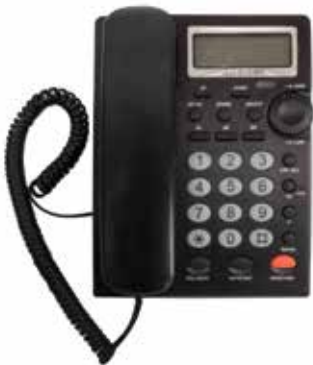
TX251 Cabin station with display, phonebook and hands-free function. Magnetized handset for wall mounting.

The AlphaConnect is using analog telephones or talk balk systems for locations such as cabins or offices, typically dry, and places with room temperature and little to no noise.