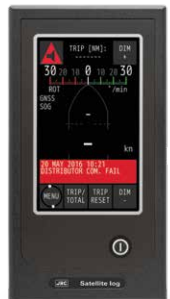
Alert content bar